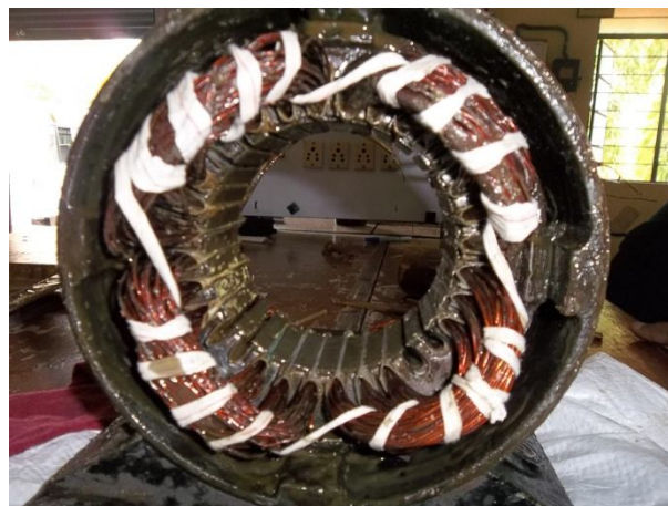
Figure 1 Nanocomposite filled enamel coated induction motor